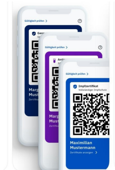
CovPass App: Blue certificate: Fully vaccinated Dark blue certificate Fully recovered