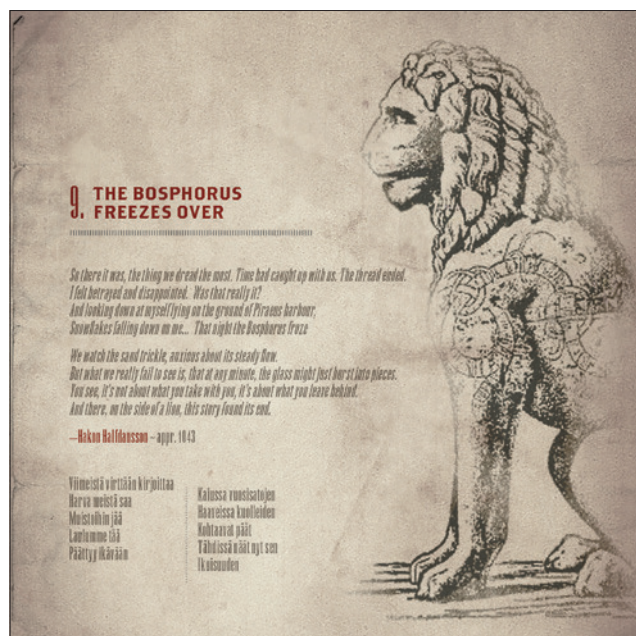
Fig. 12 The »Piraeus Lion«, booklet of the album »Stand up and Fight« (2011), p. 12.

The picture accompanying the song lyrics (fig. 12) shows a seated lion with drawings on its shoulders and legs. This is the famous c. 3 m-tall »Piraeus Lion«, made from marble and dating from the 4 th century BC, which used to stand at the entrance of Athens' harbour in Piraeus together with three other lions, but since 1692 guarding the Arsenal in Venice 273 . The lion sculpture bears three runic inscriptions