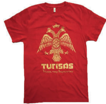
Fig. 15 T-shirt with the double-headed eagle motif and a Greek inscription referring to the »Tagma tōn Varangōn« (»unit of the Varangians«). – (Screenshot from https://shop.turisas.com/ ).

Constantinople, still existent in the 11 th century and until today a recognisable emblem of the city, avoiding an overload of Viking symbols to evoke a heroic past.