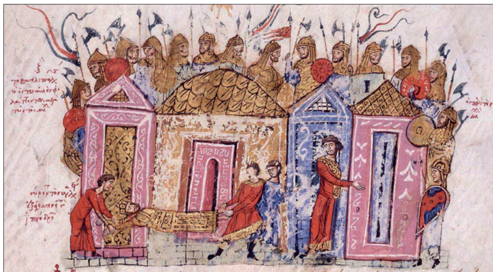
Fig. 10 Miniature from the Skylitzes Matritensis, fol. 26 r , depicting the body of Emperor Leon V dragged to the Hippodrome the Skyla Gate, Madrid, Biblioteca Nacional, Cod. Vitr. 26-2. – (After Tsamakda, Skylitzes 65 fig. 50).

the inscription of a 13 th -14 th -century Byzantine gold pendant cross with a lapis lazuli inlay, today in the Benaki Museum in Athens/GR 238 . The title sebastos was until the 12 th century mostly given to members of the imperial family, but later, in the 13 th and 14 th centuries, to leaders of ethnic units. Therefore, the Georgios Varangopoulos on the cross might actually refer to a leader of the Varangian Guard 239 . The surnames Varangopoulos and Varangos are well attested in Byzantine texts and inscriptions in the 13 th and especially the 14 th centuries 240 , testifying to the long presence of Varangians (and their offspring) in the Byzantine Empire.