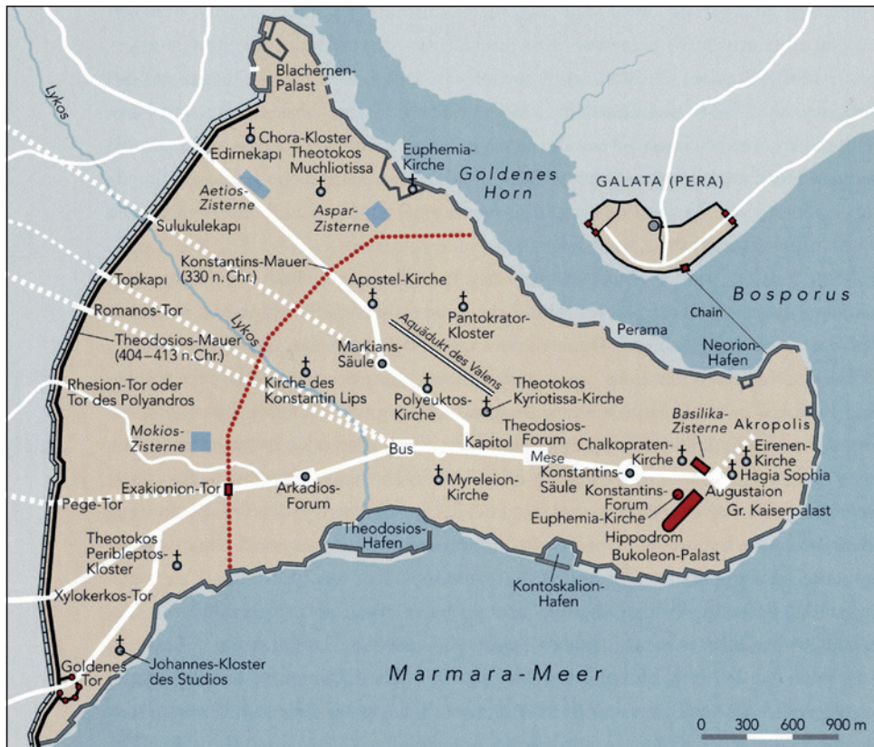
Fig. 13 Map of Constantinople with the chain from the east of the Neorion Harbour to Pera. – (After Asutay-Effenberger/Effenberger, Byzanz 56 fig. 14, with permission; chain drawn in by the author).

Scandinavian sources, especially the sagas. The Morkinskinna and the Heimskringla as well as other sagas reveal a positive view in their stories, which are always mingled with fiction. Byzantium provided an attraction for Scandinavia that could not be beaten by the Occident, although Scandinavia was affiliated steadily with the Latin Church. The Byzantines on the other hand had purposefully intensified a successful trading network and supported trading immigrants to increase mercantile activities. Furthermore, the appeal of the exotic, for the unknown and for adventure in general should not be underestimated 274 . Thus, the positive image of Byzantium was an expression of centuries of productive cultural exchange 275 , attested by the material culture of Scandinavia, such as imitation coins and Byzantine-style cross pendants. Thus, the »semantics of Byzantium in the cultural memory remains remarkably stable« 276 .