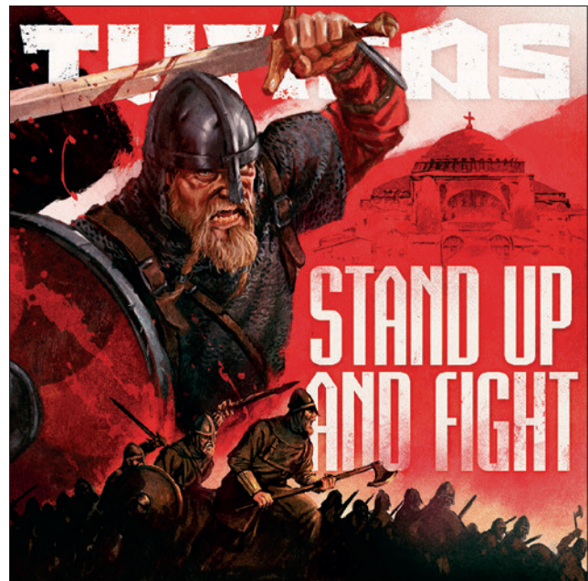
Fig. 3 Cover of the album »Stand up and Fight« by Turisas (2011). – (© Century Media Records, with kind permission).

Greek: »Βένετοι – Πράσινοι« (»Blues« and »Greens«), referring to the colours of the racing teams.