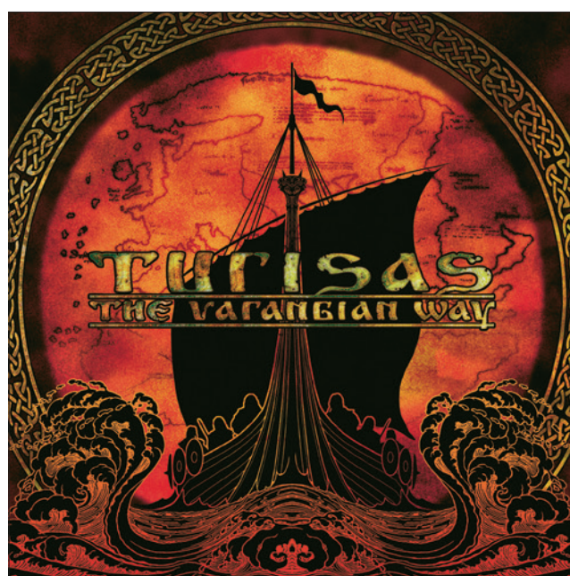
Fig. 1 Cover of the album »The Varangian Way« by Turisas (2007). – (© Century Media Records, with kind permission).

The following Turisas album from 2011, »Stand Up and Fight«, takes up the story line and starts with the energetic and dynamic song »The March of the Varangian Guard«. The story continues with songs describing Constantinople, including, for example, a race in the hippodrome (circus), continues with »The Great Escape« and ends with the song »The Bosphorus Freezes Over«.