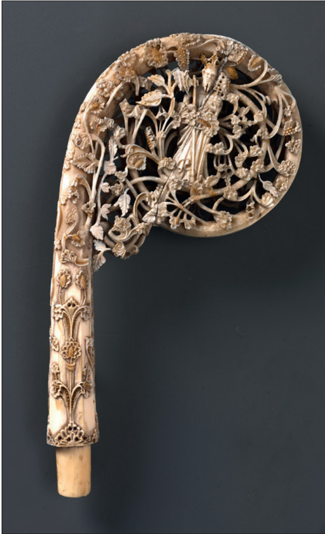
Fig. 8 The »Wingfield-Digby Crozier«, made in Norway from carved walrus ivory with traces of gilding, late 14 th century, Victoria and Albert Museum London, inv. no. A.1-2002.