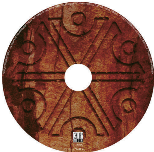
Fig. 9 CD »The Varangian Way« by Turisas (2007) with abstract »sign of Perun«. – © Century Media Records, with kind permission).

one man« 193 . It has been discussed whether Harald's riches were made in Constantinople or in Kiev, but it seems that it was rather in the former and brought home via the latter 194 . Whether he acquired his wealth through misappropriation of the imperial treasury or (also) after the revolt against Emperor Michael V, when he might have filled his pockets, remains unclear, but he seems to have come home with what the Varangians usually went for: »for fame and for gold«. However, the question remains whether the influx of Byzantine coins in Scandinavia can actually be connected with Harald's return to Scandinavia 195 . In any case, Harald's name and career are somewhat glorified in the sagas (which does not seem to entirely reflect what the Byzantines thought), and »no doubt Harald is presented in the sagas in accordance with a certain stereotype for depicting Scandinavian kings outside their countries« 196 .