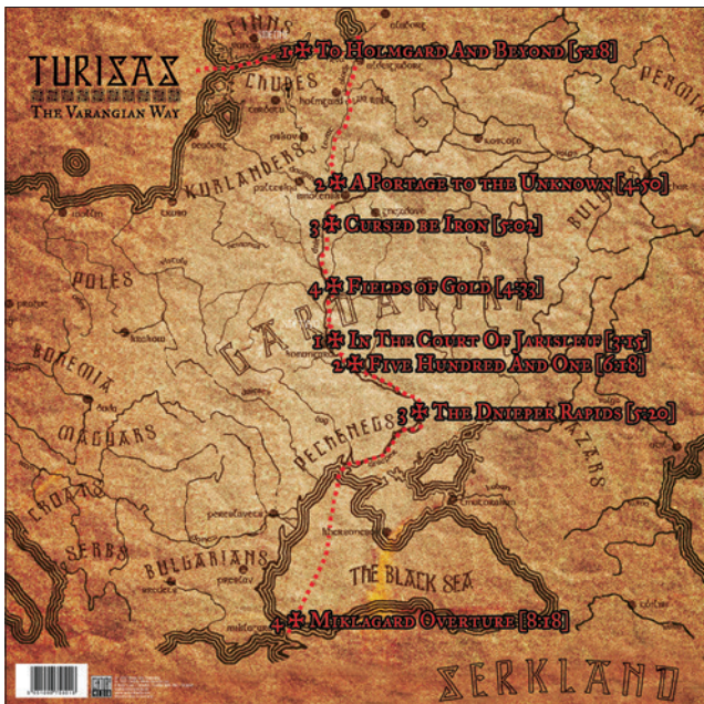
Fig. 2 Back cover of the album »The Varangian Way« by Turisas (2007). – (© Century Media Records, with kind permission).