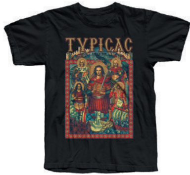
Fig. 14 T-shirt inspired by Byzantine icons with the Archangel Michael surrounded by saints – all given the facial features of the band members. – (Screenshot from https://shop.turisas.com/ ).