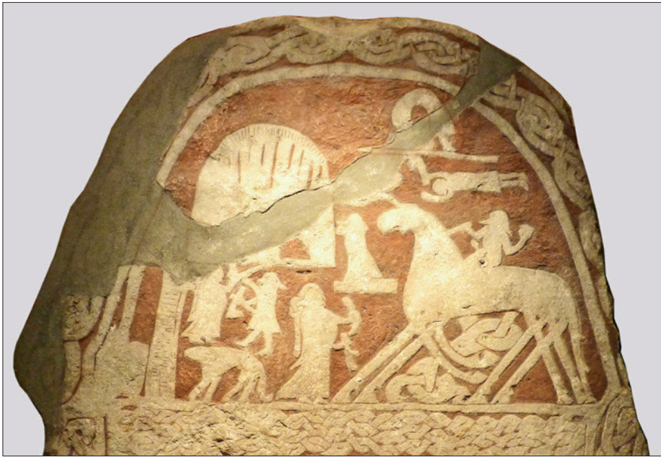
Fig. 4 Valhalla: a Valkyrie with a drinking horn at the gates of Valhalla, welcoming a Viking who has fallen in battle and is carried by the eight-legged horse of Odin, Sleipnir. Stone relief, 8 th century, Stockholm, Historiska Museet.