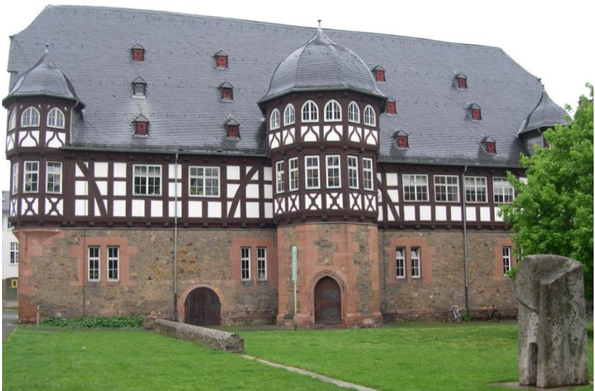
Department of Geography at Justus Liebig University of Giessen, Germany

Department of Geography University of Giessen Senckenbergstrasse 1 35390 Giessen Phone +49(0)641-99-36-200