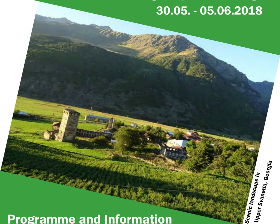
Scenic landscape in Upper Svanetia, Georgia