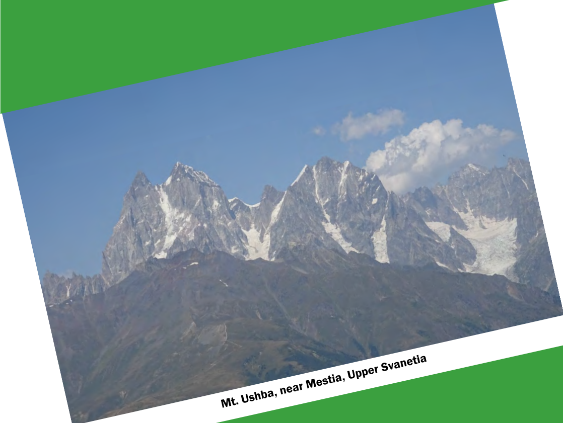
Mt. Ushba, near Mestia, Upper Svanetia