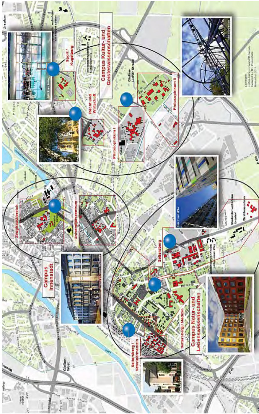
Map of the different campuses of the Justus-Liebig-University Giessen. The Department of Geography is located at the northernmost campus (Zeughausbereich).