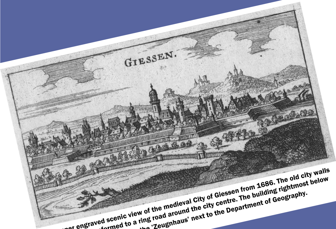
A copper engraved scenic view of the medieval City of Giessen from 1686. The old city walls have been transformed to a ring road around the city centre. The building rightmost below the castle the hill is the 'Zeugnhaus' next to the Department of Geography.