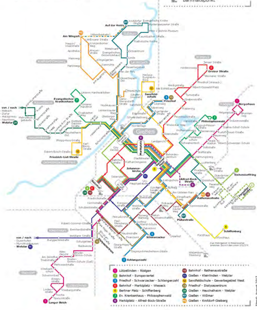
Route map of the Giessen Bus Service (Bus lines). The nearest bus stop to the Department of Geography is 'Marktplatz' (Market Square). The bus stop 'Liebigstraße' is for the Guesthouse Wilhelma.