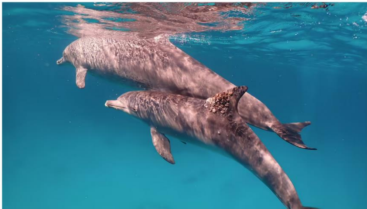
La peau de l'ailleron dorsal de ce grand dauphin montre des signes d'infection fongique.

Dans la mer Rouge, un groupe de dauphins se frottent régulièrement à des récifs coralliens. Ce comportement leur permettrait de soigner leur peau grâce au mucus des coraux, riche en molécules aux propriétés thérapeutiques