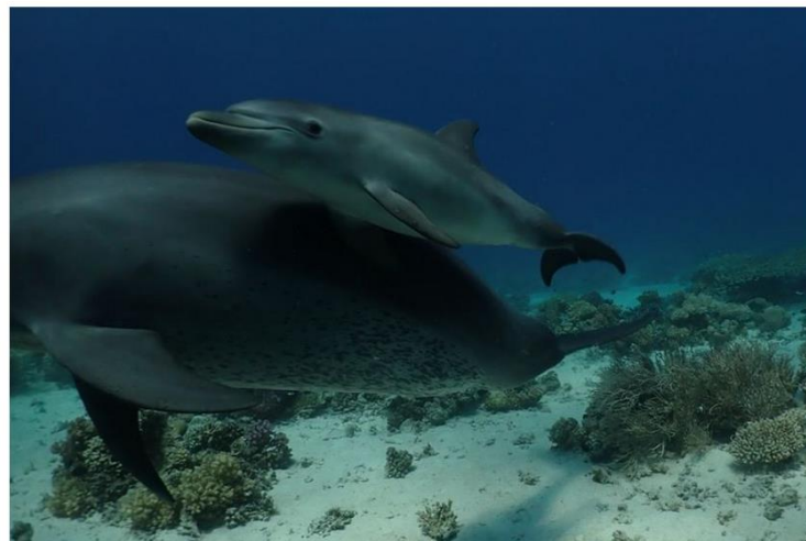
Forschende beobachteten Delfine im Roten Meer vor Ägypten dabei, wie sie sich an ausgewählten Korallen und Schwämmen rieben und dafür auch in einer Reihe anstellten