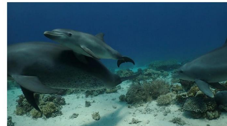
Delfinmutter mit ihrem Kalb an den "medizinischen" Korallen.

20. Mai 2022 Diesen Artikel merken Meine Merkliste anzeigen