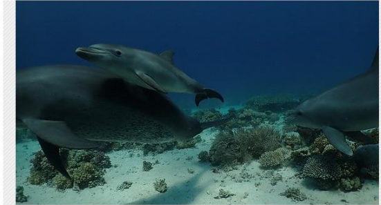
In the Red Sea off the coast of Egypt, bottlenose dolphins were spotted in 2009 doing something unusual. They lined up to rub their bodies against coral.

CHN/Stylemagazine.com NewsWire | 5/19/2022, 11:41 a.m.