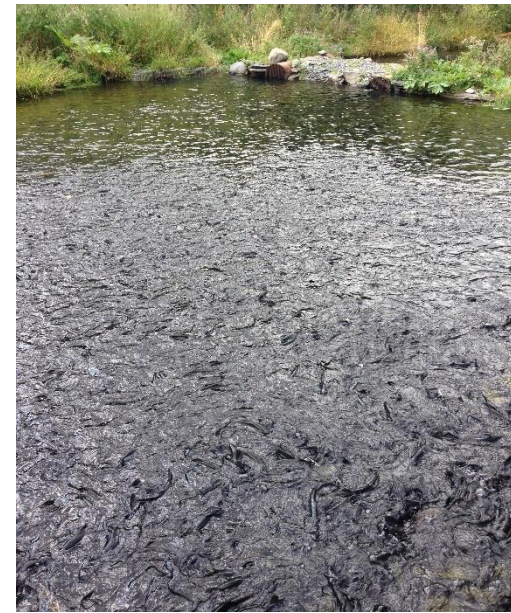
Trout Farm in Sno