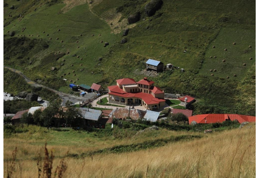
Hotel "Juta House"