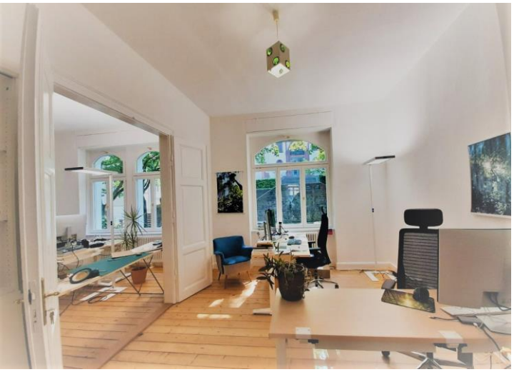
Co-working spaces for our fellows @ Bauer

Comfortable apartments with fully equipped kitchens have been reserved in the university's 'Alexander von Humboldt' guest house, but fellows are welcome to take up residence elsewhere according their preferences. They are provided with newly renovated and furnished coworking office/studio spaces at the Panel on Planetary Thinking's headquarters within the city center inside one Giessen's characteristic, old-style buildings.