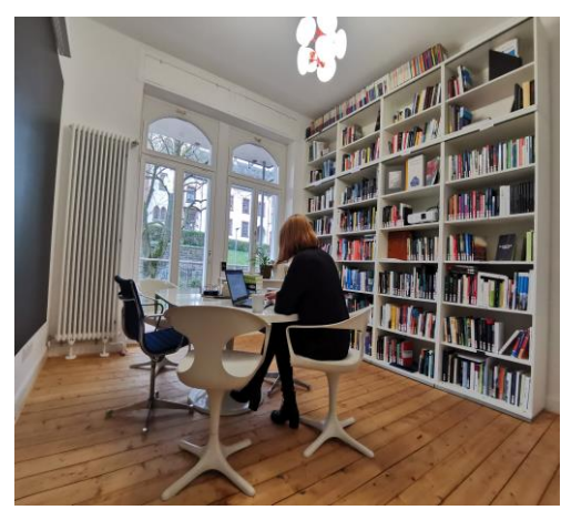
Space Age Lounge and expanding Planetary Library.

Please do not hesitate to contact us with any specific requests. As we work closely with the JLU's international office, future fellows will receive adequate support on any formalities connected to their stay in Giessen (e.g., questions about health insurance or residence permits).