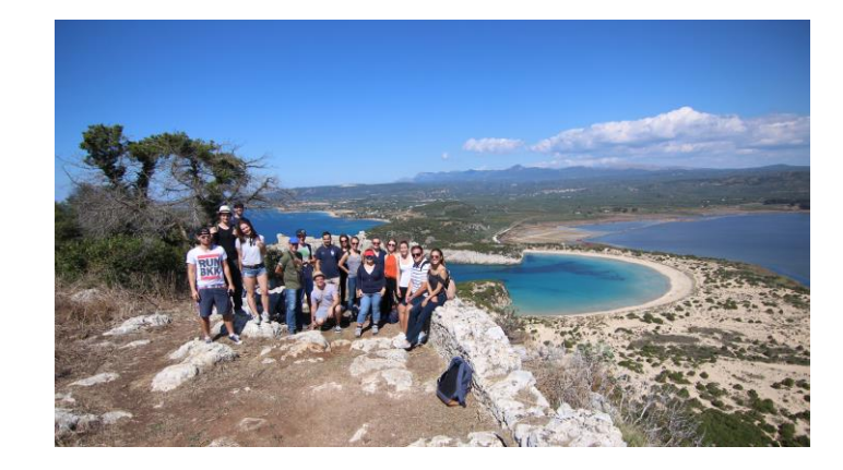
JLU-AUTh joint excursion to Greece in the frame of the course "Climate change and impacts in Greece" @NEO, 27 September-4 October 2017