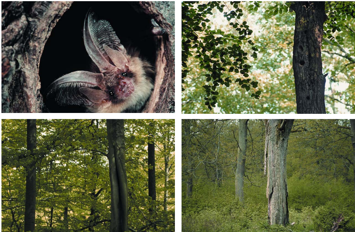
Figure 1 Examples of tree holes (clockwise from top left: Brown long-eared bat looking from a woodpecker hole; woodpecker hole; loose bark; crevices).