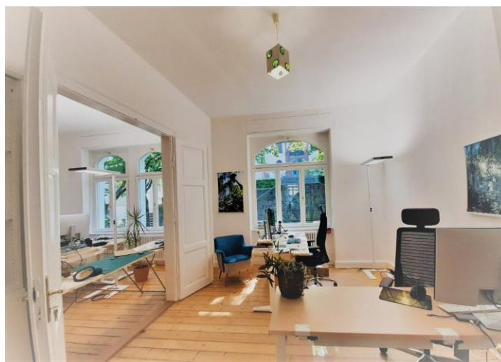
Co-working spaces for our fellows

Comfortable apartments with fully equipped kitchens have been reserved in the university's ' Alexander von Humboldt ' guest house , but fellows are welcome to take up residence elsewhere according to their preferences. They are provided with newly renovated and furnished co-working office/studio spaces at the Panel on Planetary Thinking's headquarters within the city center — inside one of Giessen's most characteristic, old-style buildings.