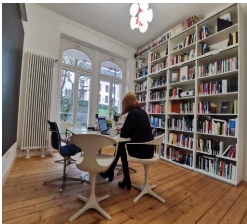
Space Age Lounge and expanding Planetary Library.

Please do not hesitate to contact us with any specific requests. As we work closely with the JLU's international office, future fellows will receive adequate support on any formalities connected to their stay in Giessen (e.g., questions about health insurance or residence permits).