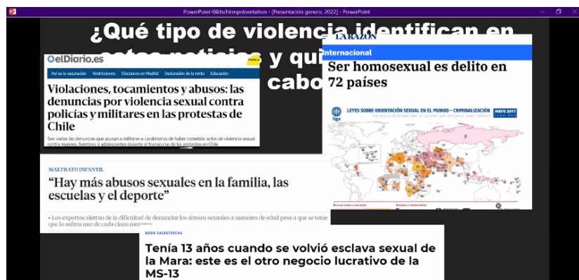
One of the task with headlines of online newspapers to discuss Violence in social networks.

Thirdly, professors designed a program according to the international nature of participants. Note that both teachers and students alike came not only from different disciplines but also from other cultures.