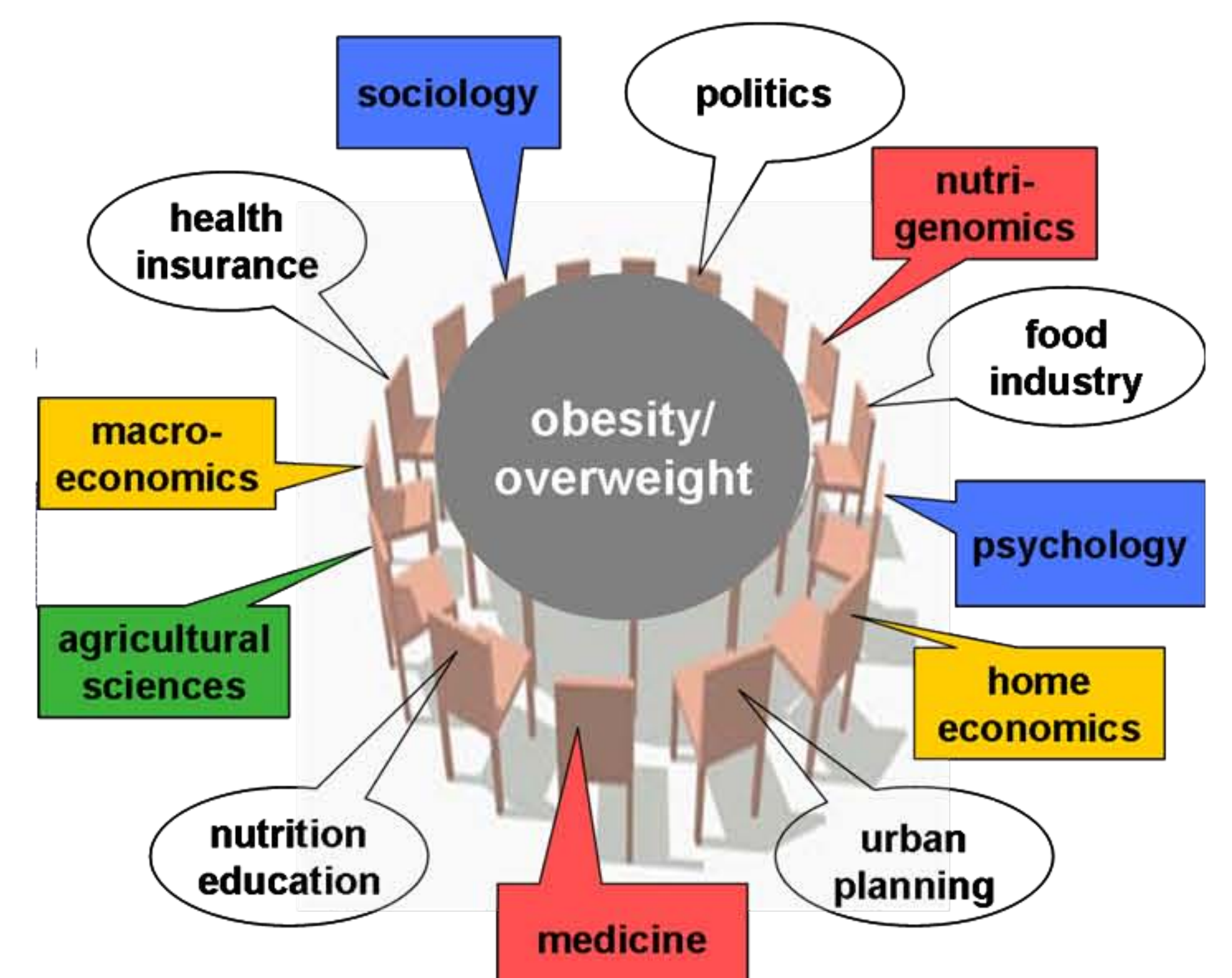
Fig. 3: Nutrition Ecology offers a platform for discipline-transcending problem-solving processes, exemplified for obesity/overweight as a complex problem

The synthesis of different disciplinary perspectives and of knowledge from science and practice may be reached, amongst others, by a recurrent integration of partial results and a consensus on applied methods and theories.