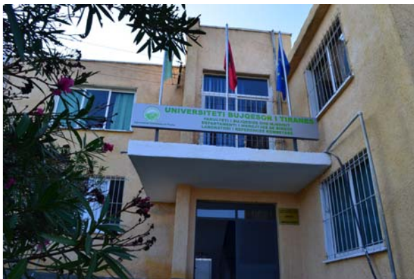
Visit of labs of the Agricultural University Tirana