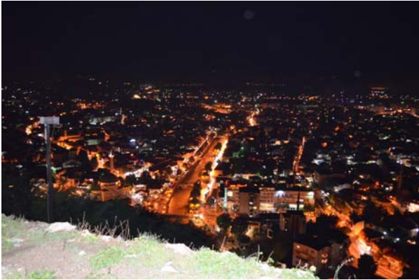
Prizren and the Sharr Mountains