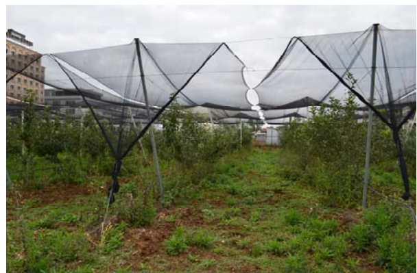
Visit of an experimental field of the Agricultural Faculty of Prishtina University