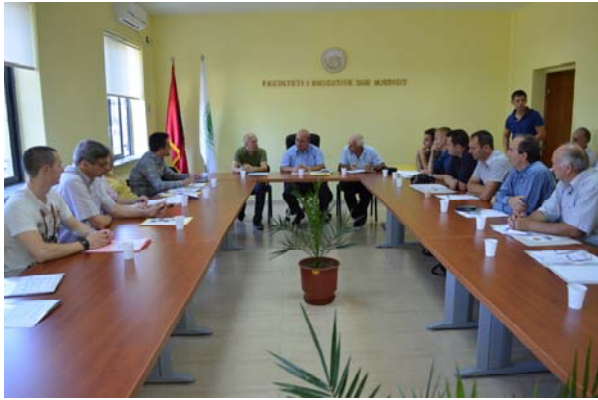
Opening at the Agricultural University Tirana