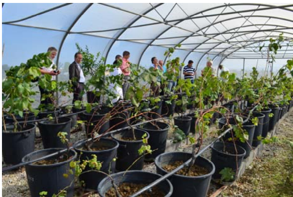
Experiments with grape varieties