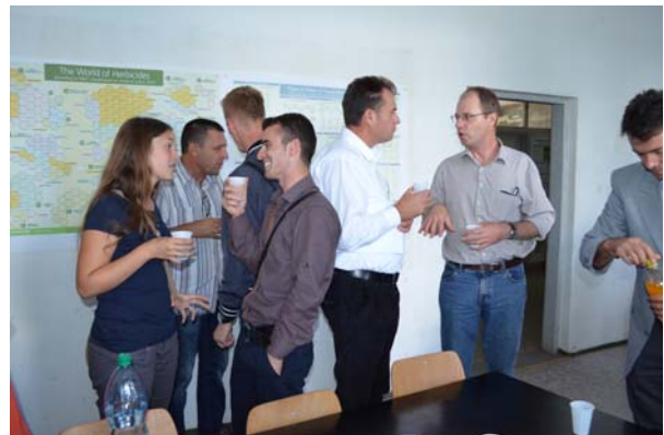
Opening at the Agricultural Faculty of Prishtina University 'Hasan Prishtina'