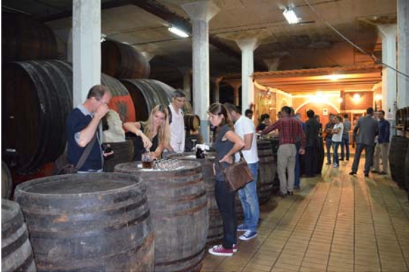
Visiting 'Stone Castle'